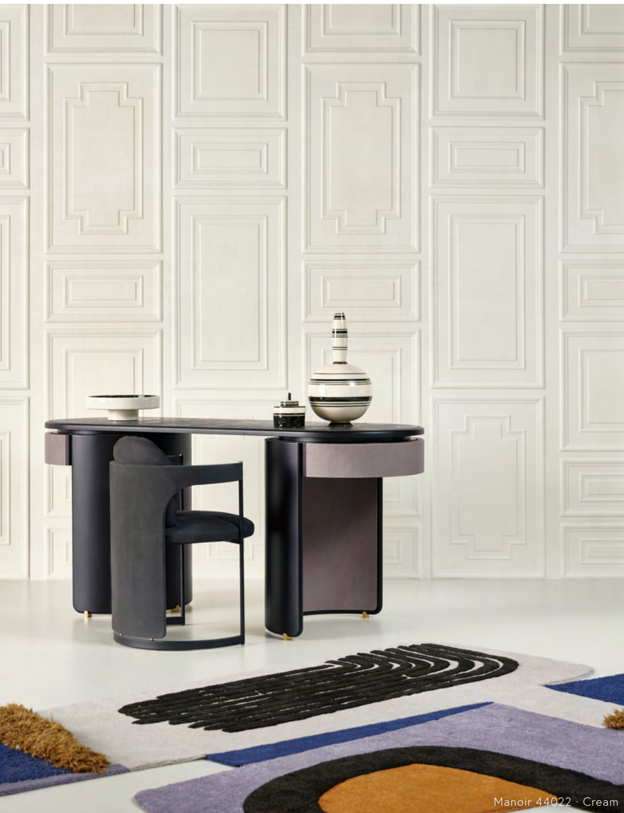
Manoir 44022 · Cream