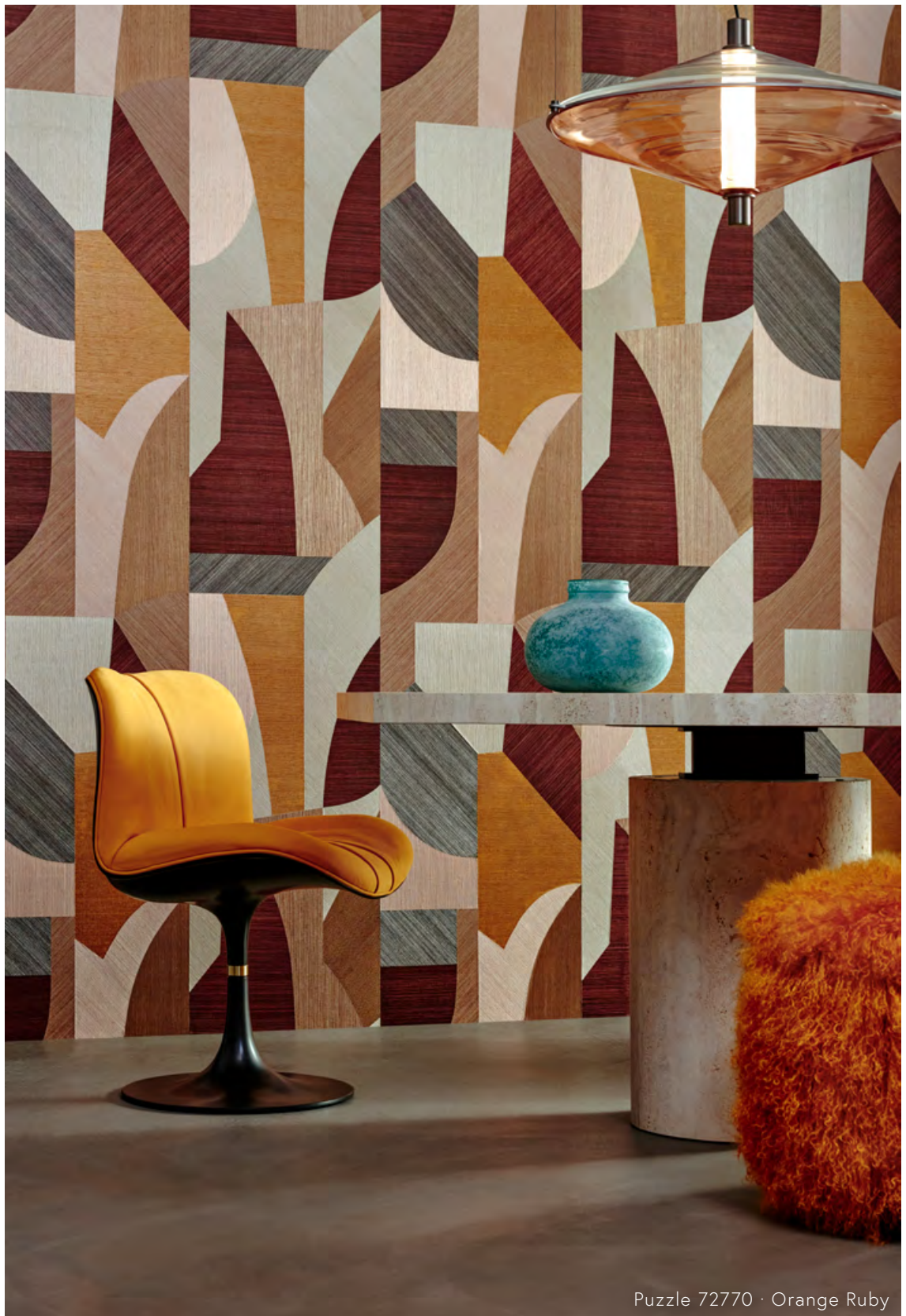
Puzzle 72770 · Orange Ruby