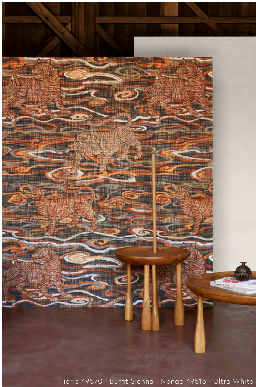
Tigris 49570 · Burnt Sienna | Nongo 49515 · Ultra White