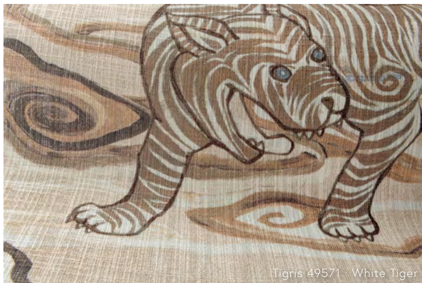
Tigris 49571 · White Tiger