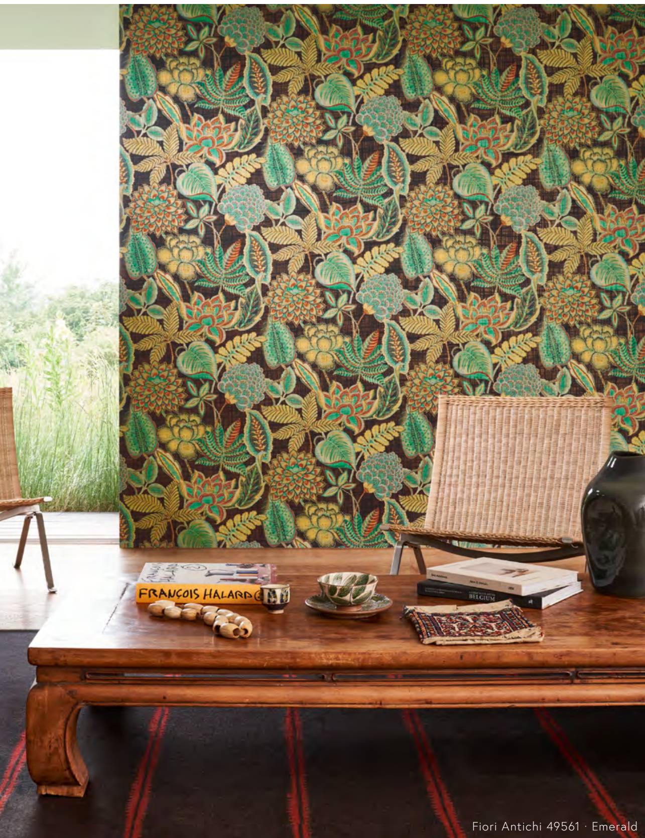
Fiori Antichi 49561 · Emerald