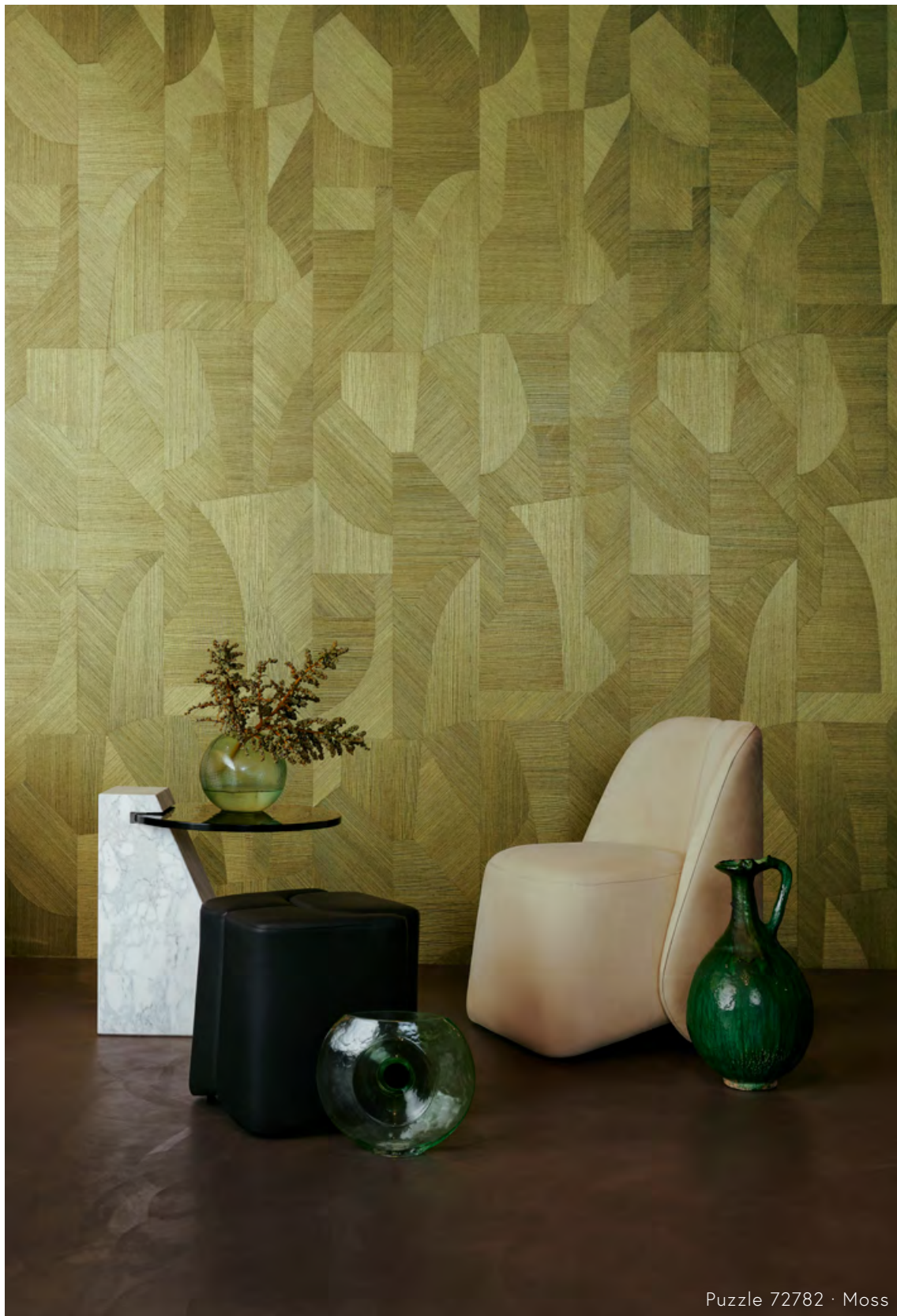
Puzzle 72782 · Moss