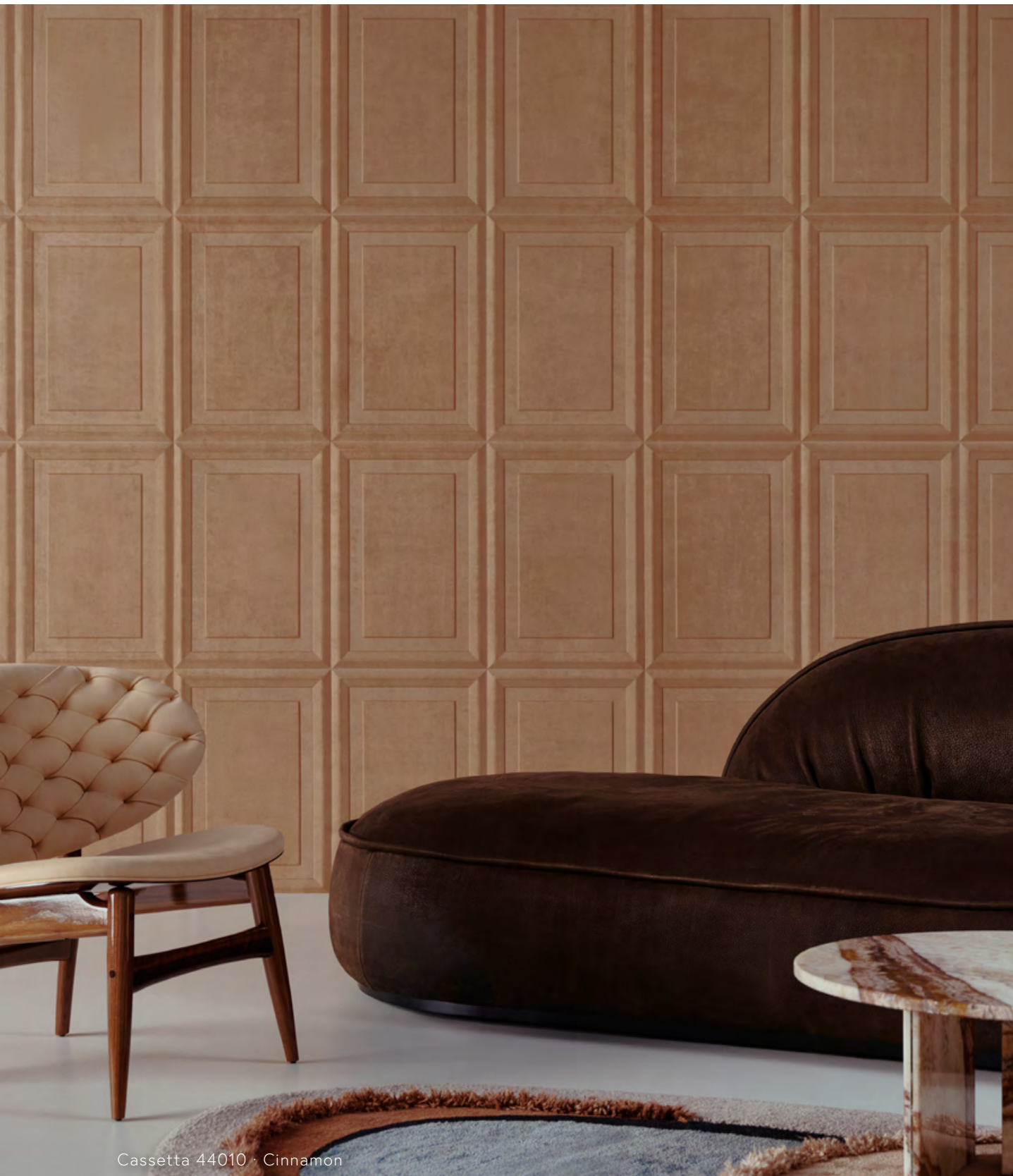
Cassetta 44010 · Cinnamon