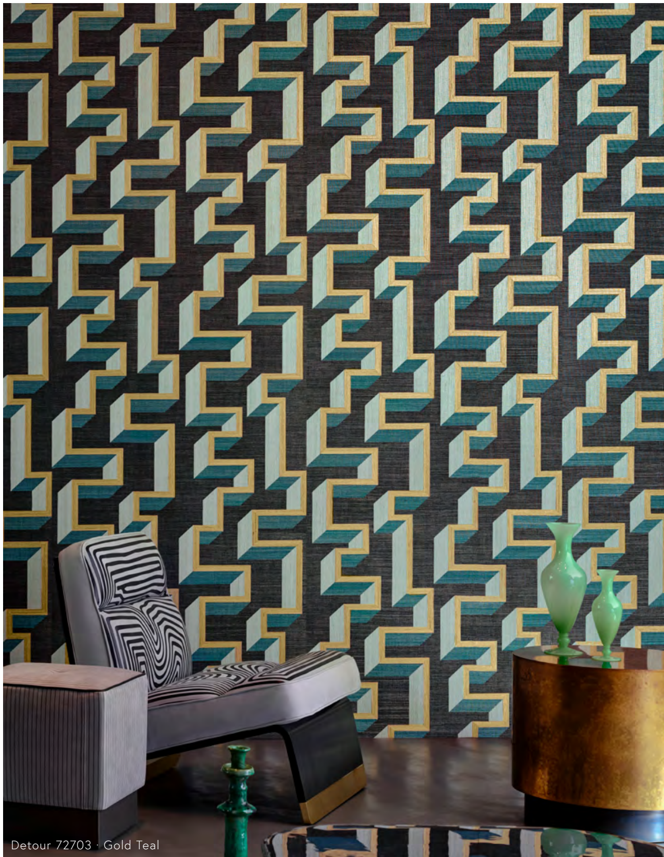
Detour 72703 · Gold Teal