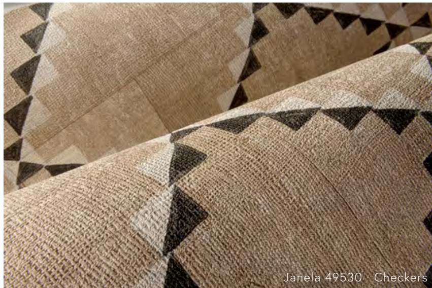
Janela 49530 · Checkers