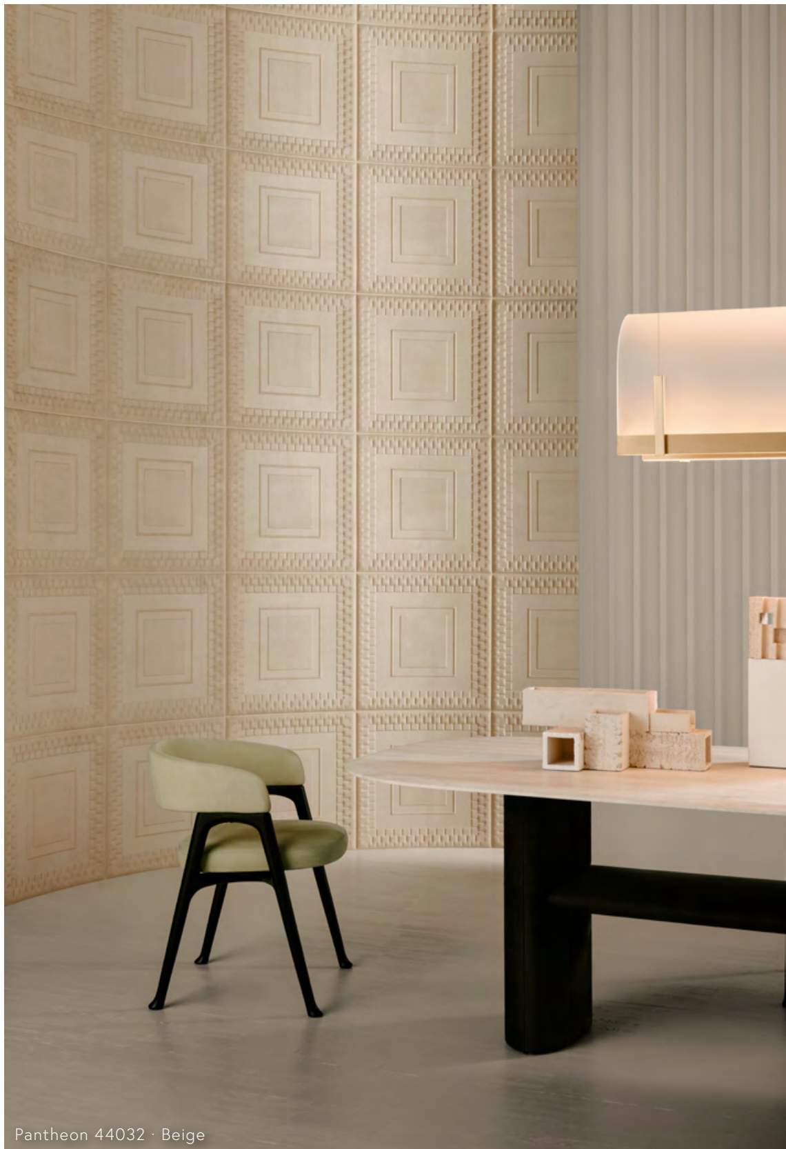
Pantheon 44032 · Beige