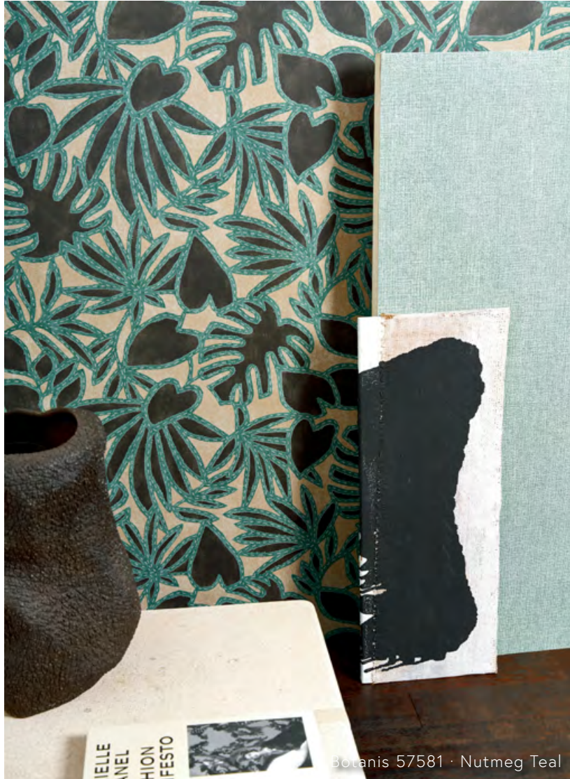
Botanis 57581 · Nutmeg Teal