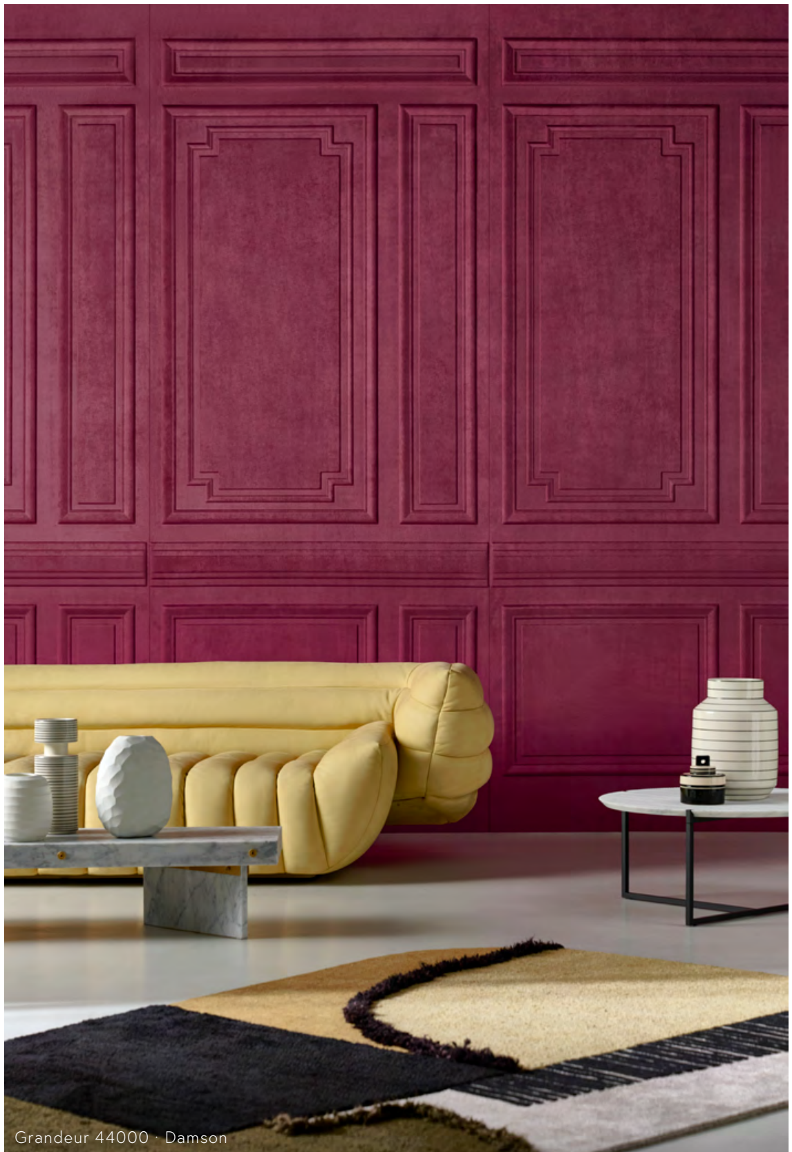
Grandeur 44000 · Damson