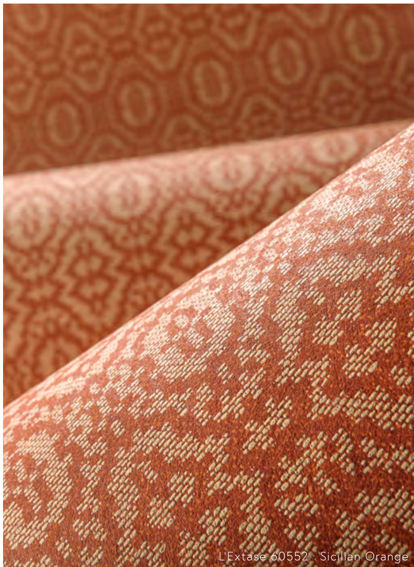
L'Extase 60552 · Sicilian Orange