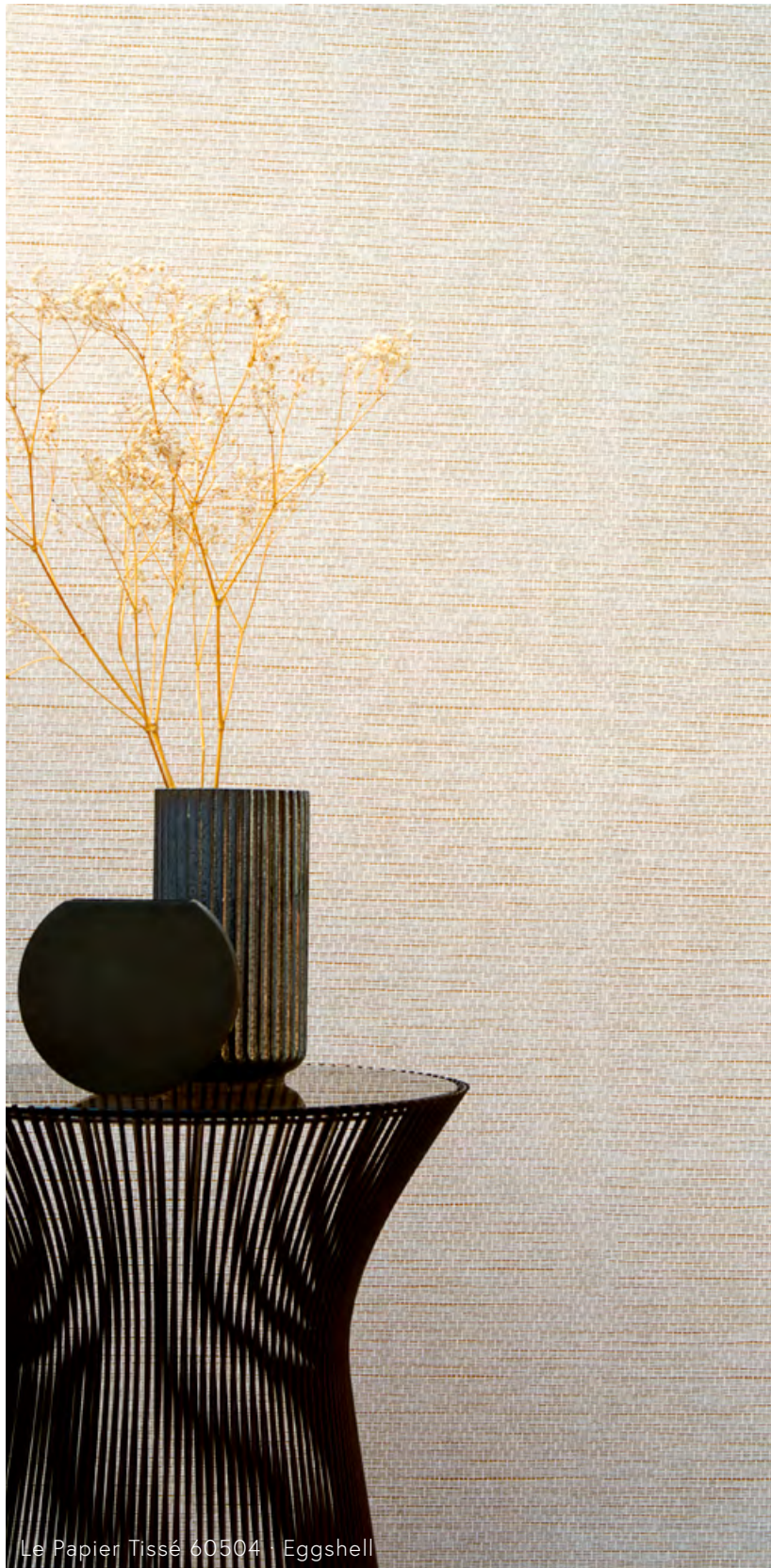
Le Papier Tissé 60504 · Eggshell