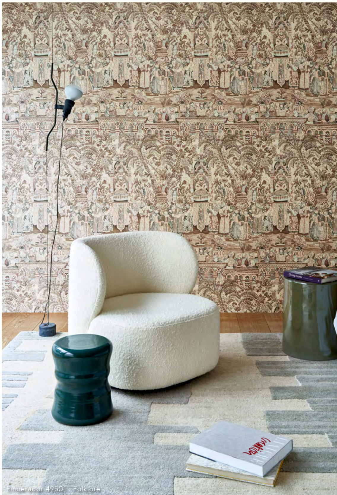
Emperador 49501 - Folklore