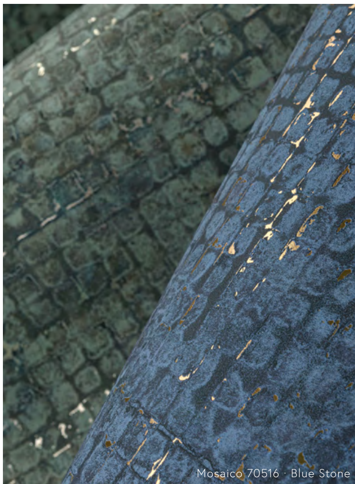
Mosaico 70516 · Blue Stone