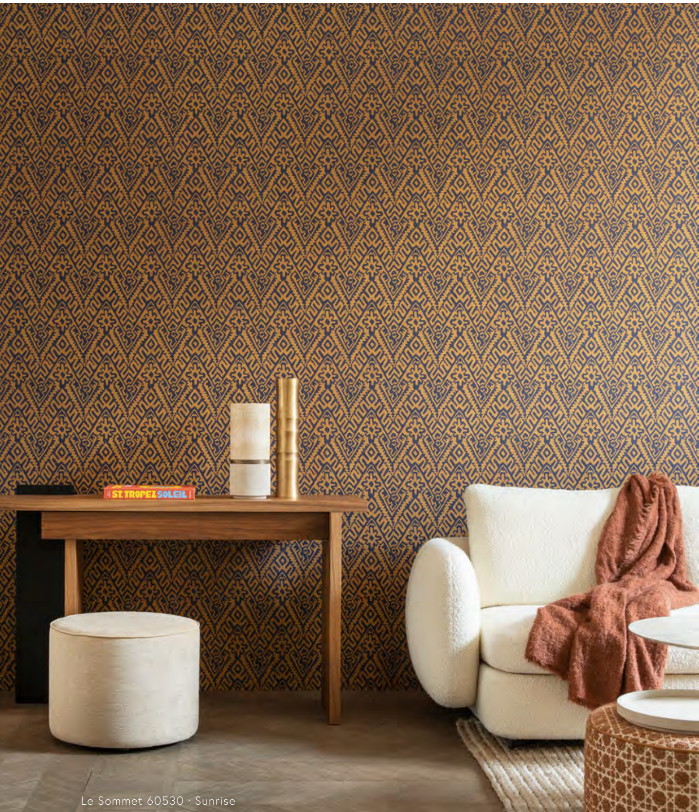
Le Sommet 60530 · Sunrise