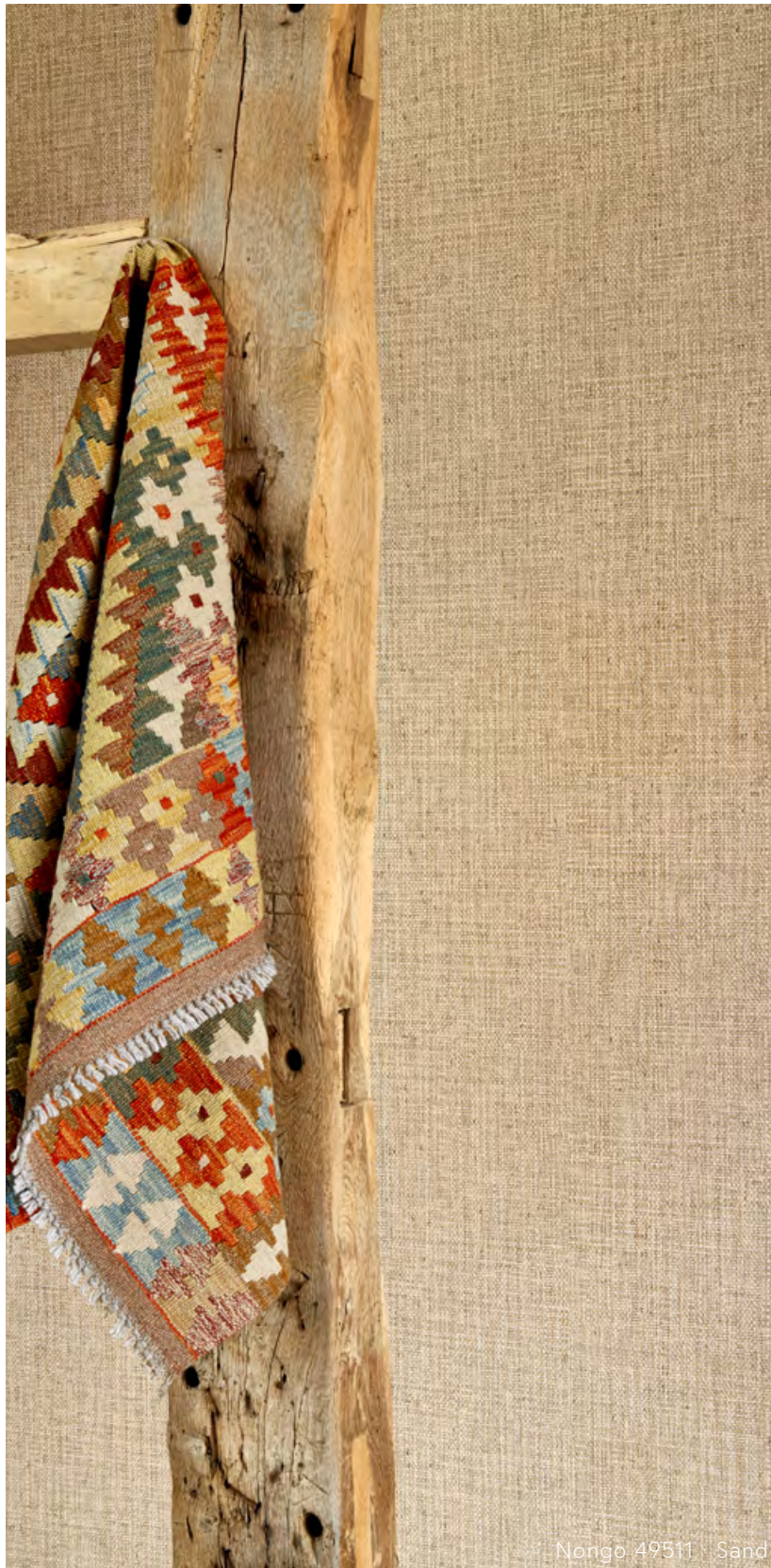
Nongo 49511 | Sand