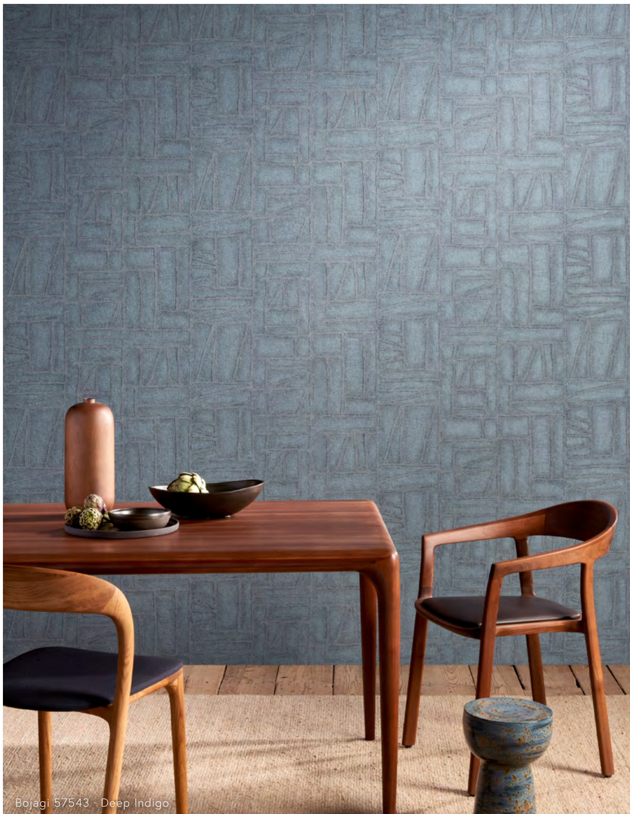
Bojagi 57543 · Deep Indigo