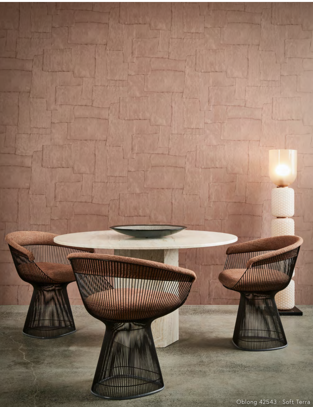
Oblong 42543 · Soft Terra