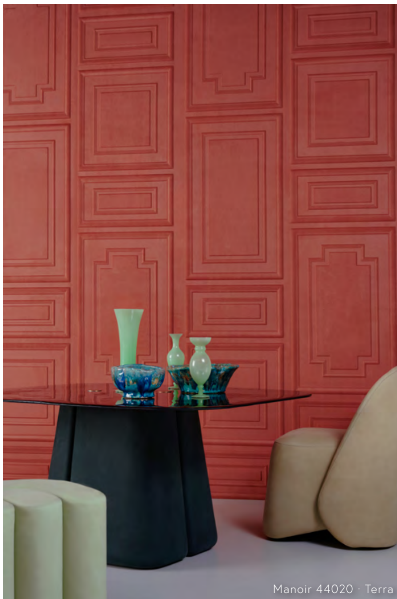
Manoir 44020 · Terra