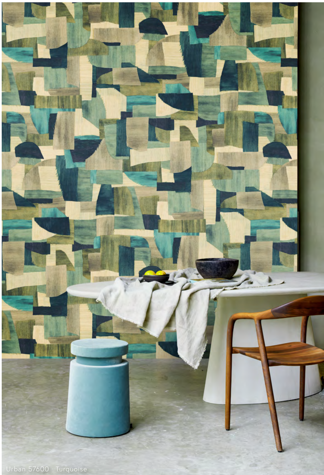
Urban 57600 · Turquoise