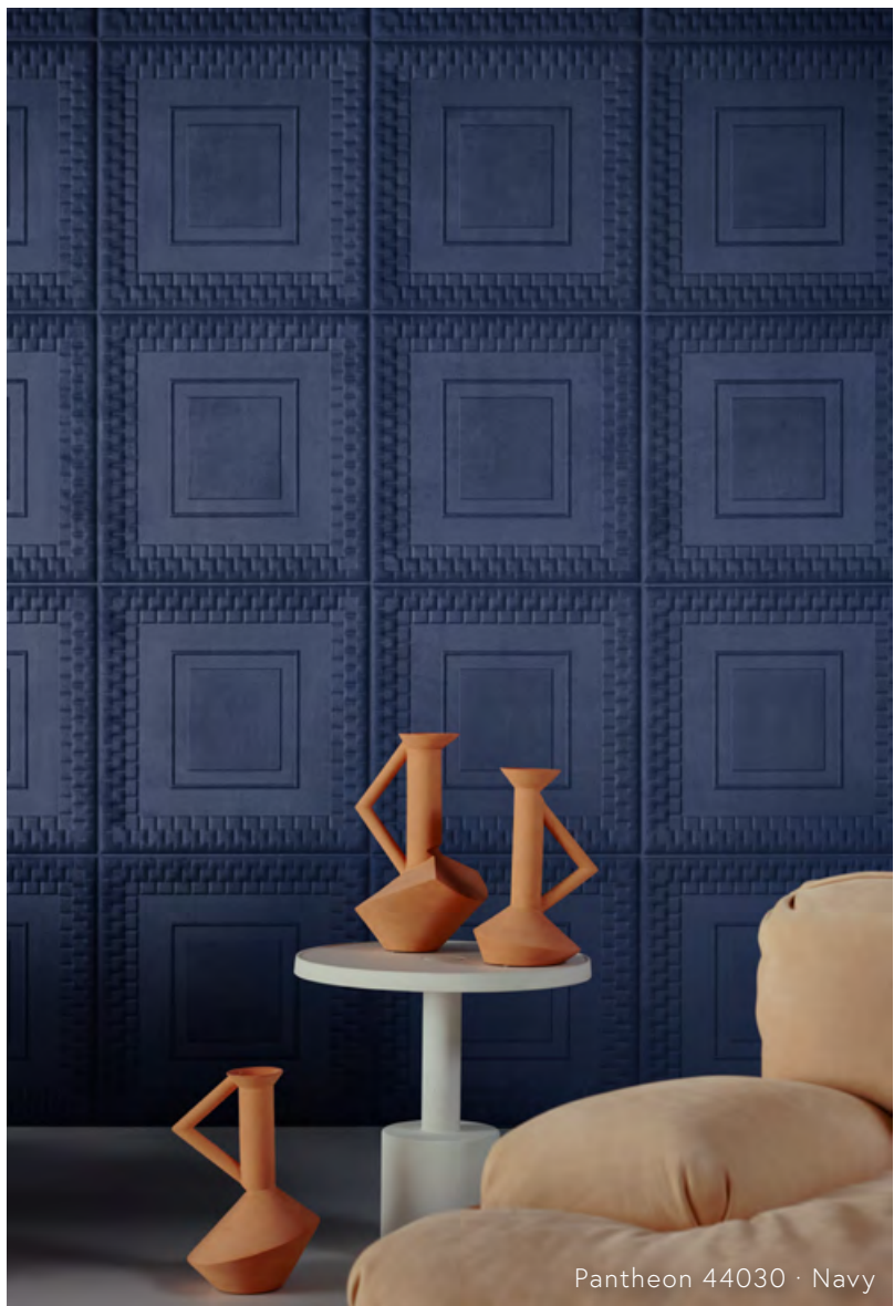
Pantheon 44030 · Navy