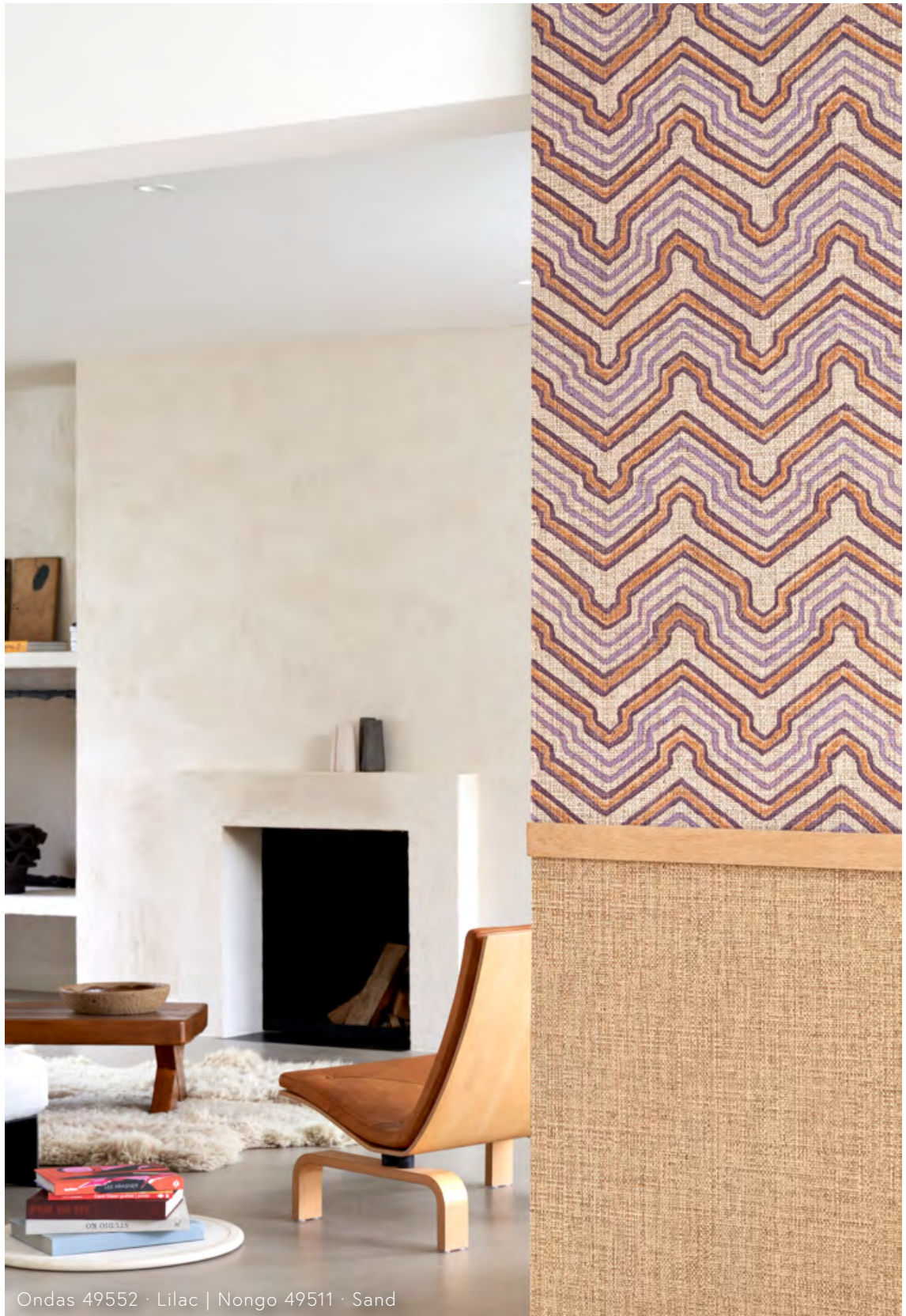
Ondas 49552 · Lilac | Nongo 49511 · Sand