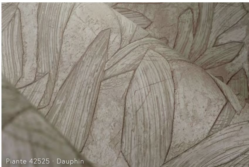
Piante 42525 · Dauphin