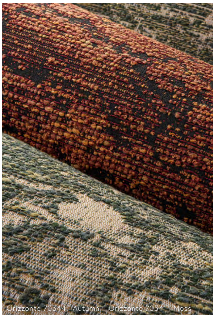
Orizzonte 70544 · Autumn | Orizzonte 70541 · Moss