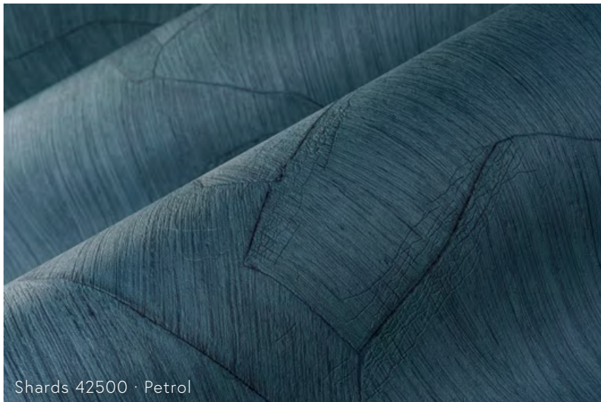
Shards 42500 · Petrol