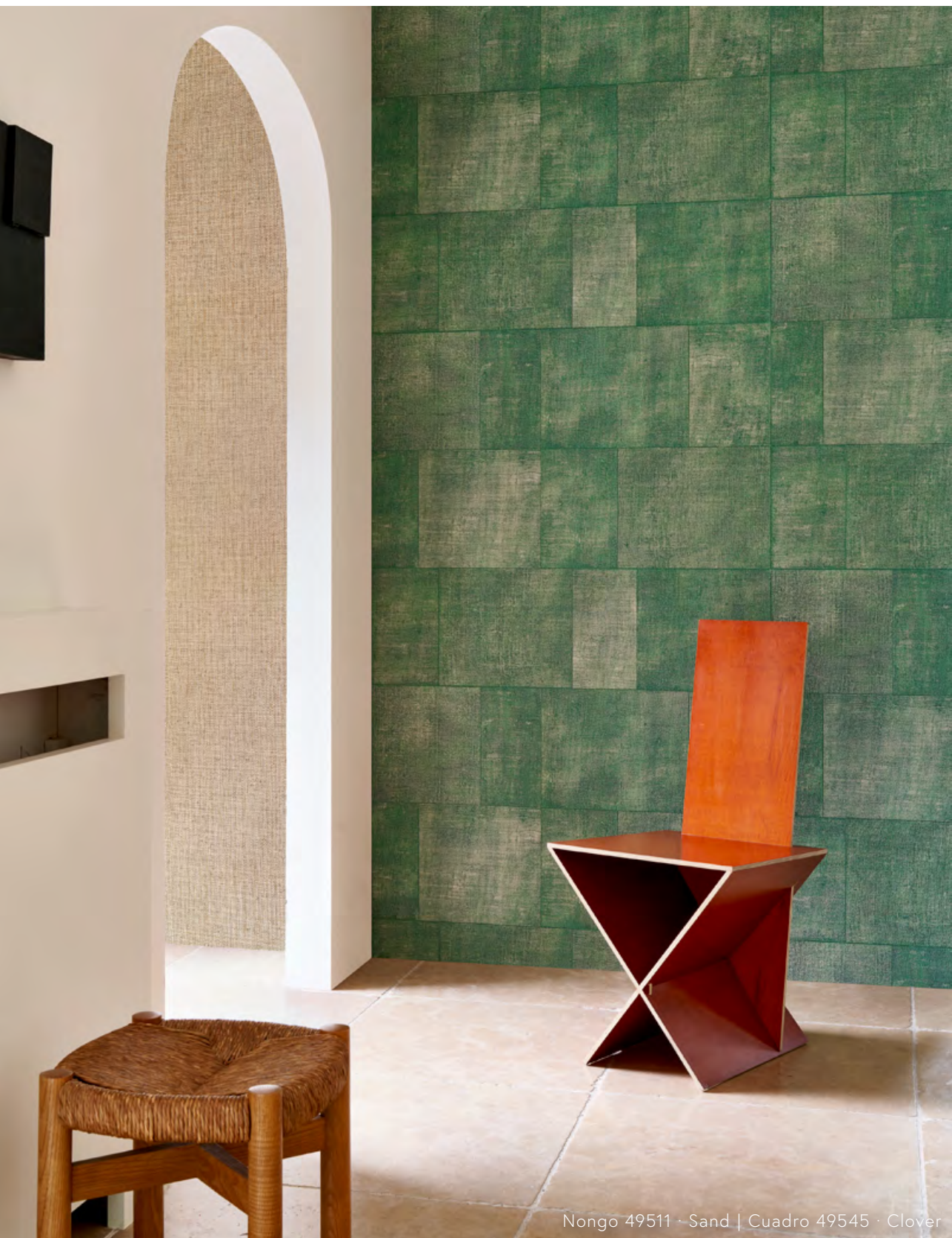
Nongo 49511 · Sand | Cuadro 49545 · Clover