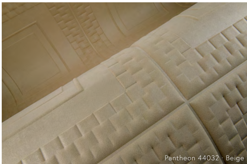
Pantheon 44032 · Beige