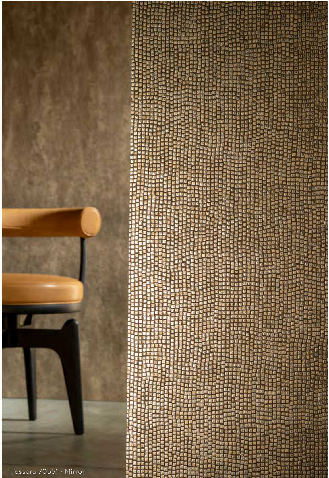
Tessera 70551 · Mirror