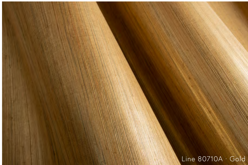
Line 80710A · Gold