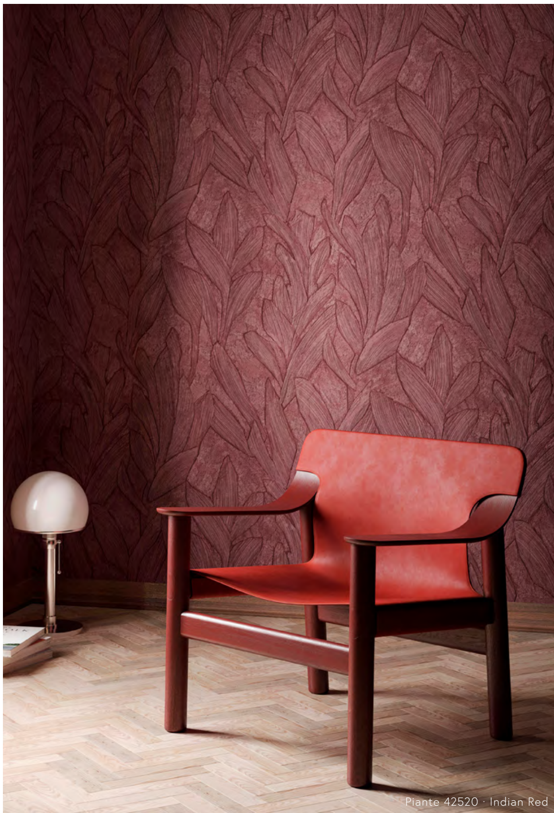
Piante 42520 · Indian Red