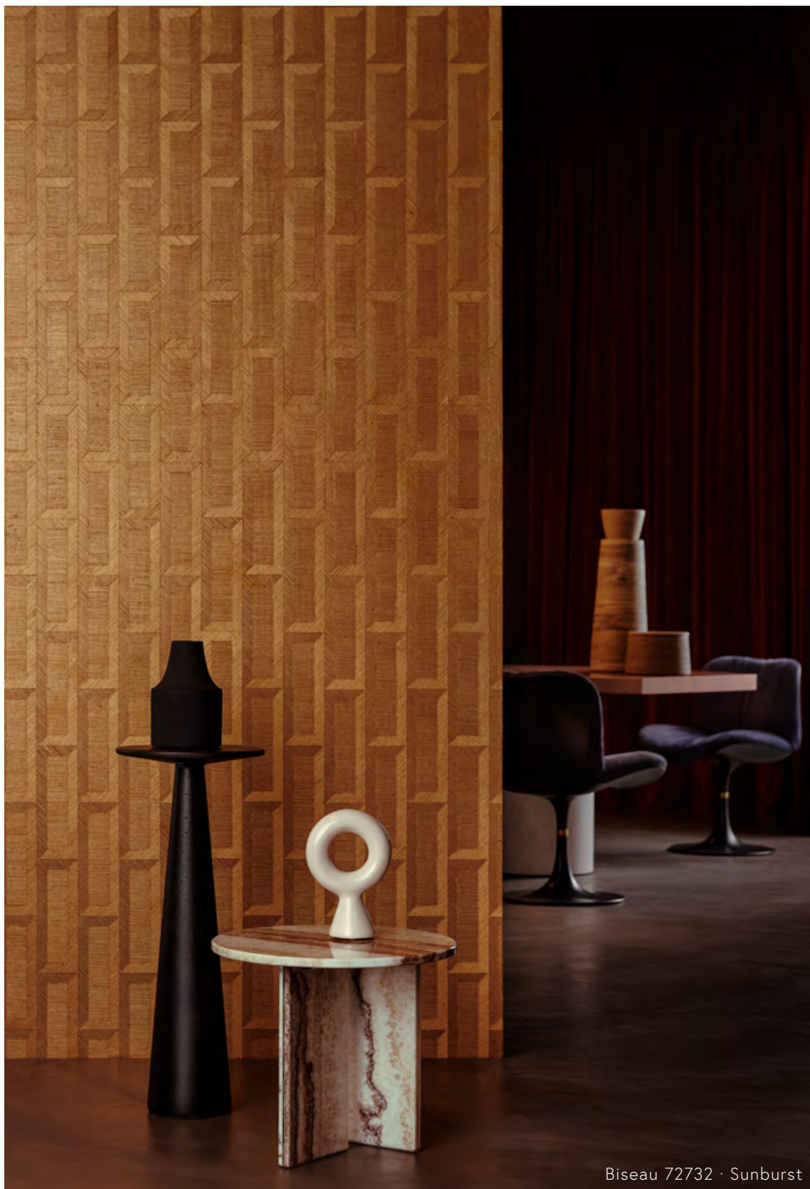
Biseau 72732 · Sunburst