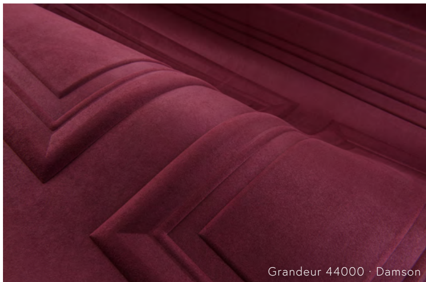
Grandeur 44000 · Damson