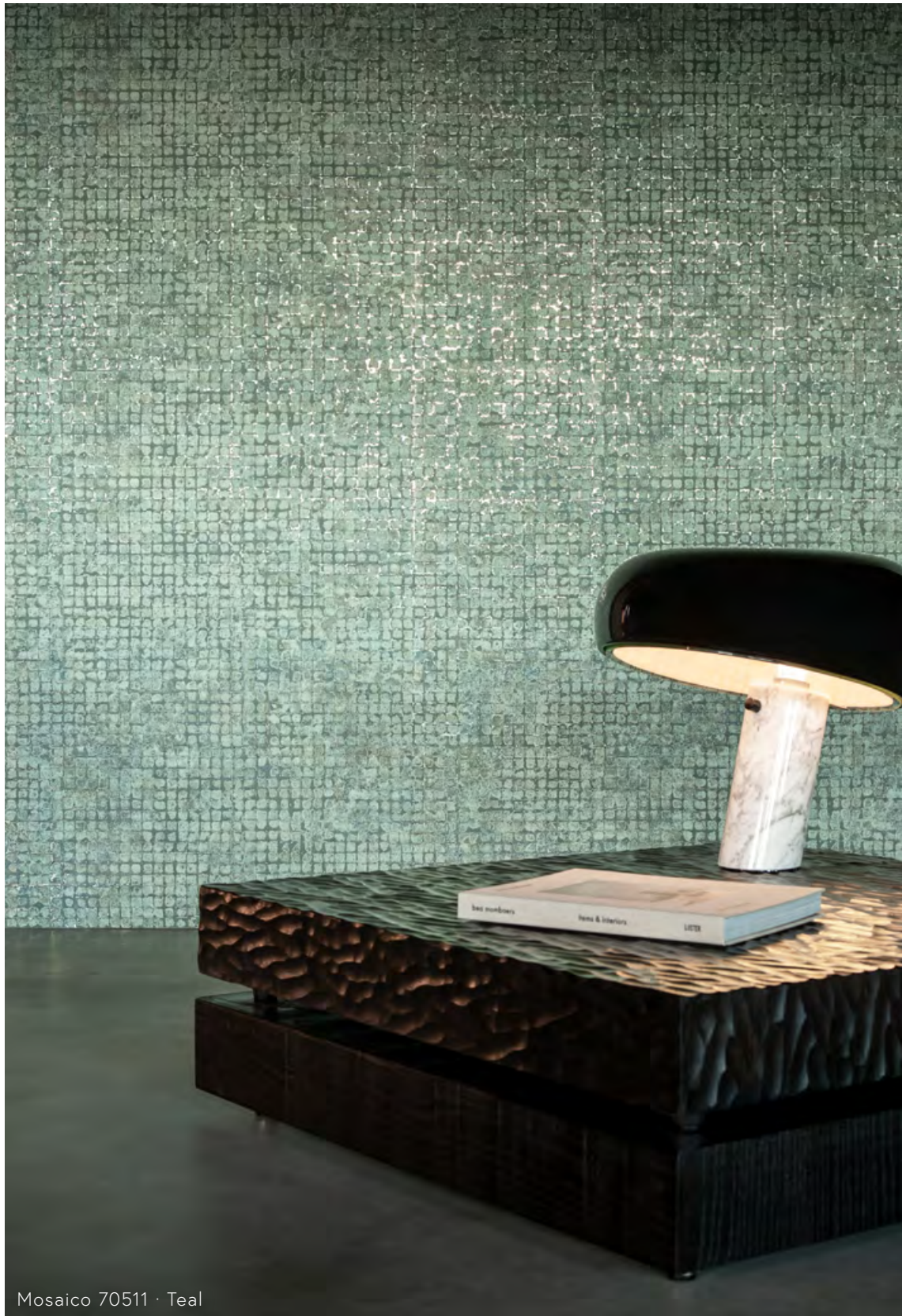
Mosaico 70511 · Teal